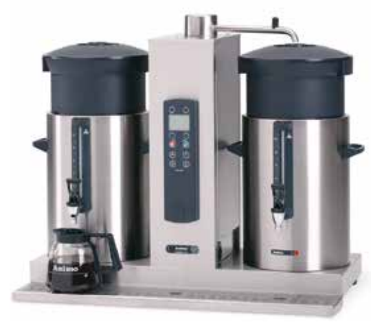
+ ComBi-line with two 10 litre containers: CB 2x10

ComBi-line machines offer the possibility of making large quantities of coffee and tea in a short time. A ComBi-line set-up is a combination of one or two continuous flow water heaters and one or two containers. The containers can be placed on a buffet, counter or serving trolley. The largest machine has a capacity of up to 1280 cups (160 litres) per hour.